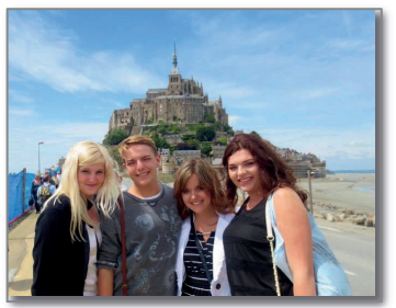
(Above): Students pose on the way to Mont St-Michel

FRANCE • GERMANY • SPAIN MARTINIQUE • QUEBEC COSTA RICA • ARGENTINA