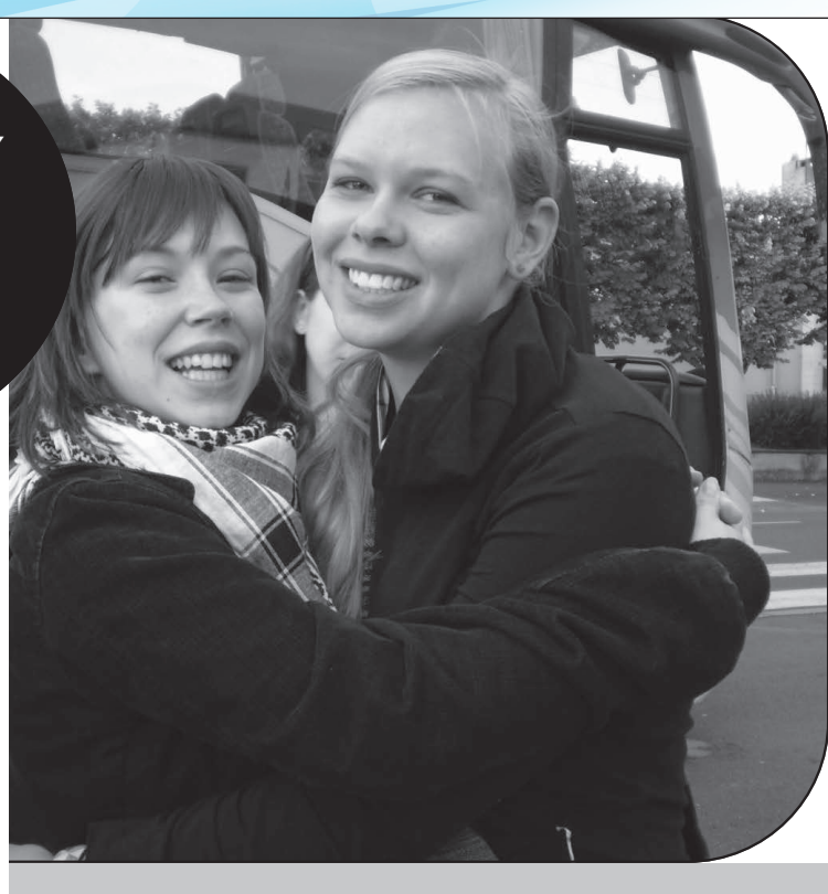
Exceptional Programs for Teachers and Students Since 1976

Standard or Customized Itineraries to France