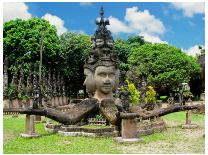
Buddha Park in Laos

My goal is to travel the world and I have been to 19 countries. I especially want to get back to Southeast Asia, specifically Laos.